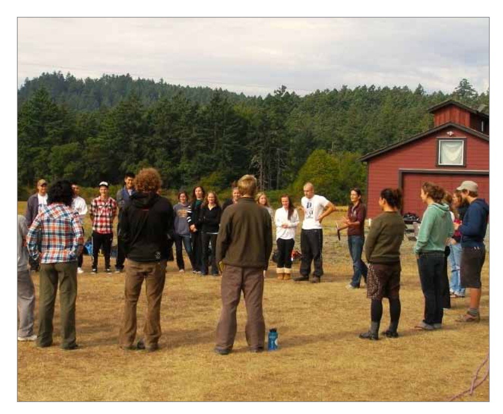
Students are welcomed to their five-day field school by Outward Bound Canada staff at the Metchosin Wilderness Camp near Victoria.

This annual trip is a long-standing tradition within the diploma program, and a number of grads over the years recognize it as a highlight of their studies here at Langara College.