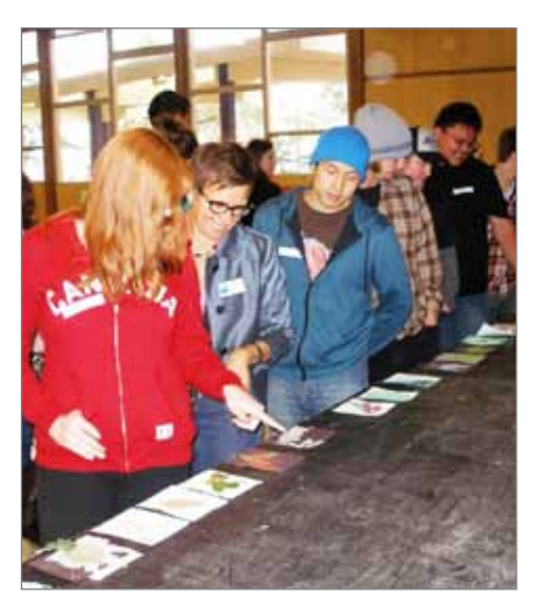
Artwork made on the field trip, showcasing various student talents, is shared by the class. The pieces were then put on display in the Department of Recreation Studies classroom.